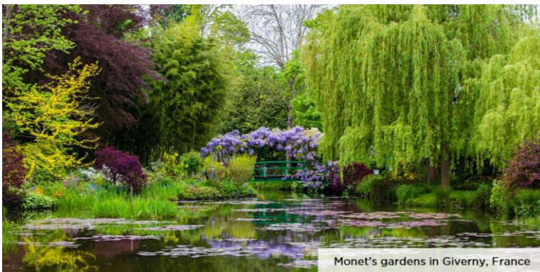
Monet's gardens in Giverny, France

Reserve by June 30 th , 2024 to save $500.00 pp on your cruise fare.